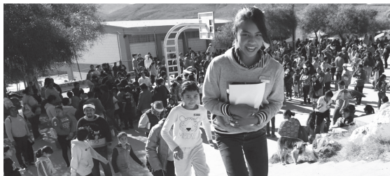
Part of the crowd in Pueblos Magicos

wrapped gifts underneath its boughs. Then we shared a brief message about how Christ is God's gift to the world that was given because of His great love for each of us. The children then got to pick a small gift from under the tree before they went on to choose their bigger (unwrapped) gift. It was a fun gospel-teaching object lesson presented in an understandable way for the children. All tied to a fun extra gift! We are excited that all of the kids got to hear the gospel.