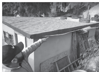
Juan Guillen pointing out a leaky roof at the church building- a potential project for us

Psalm 5:11 "But let all who take refuge in you rejoice; let them ever sing for joy, and spread your protection over them, that those who love your name may exult in you."