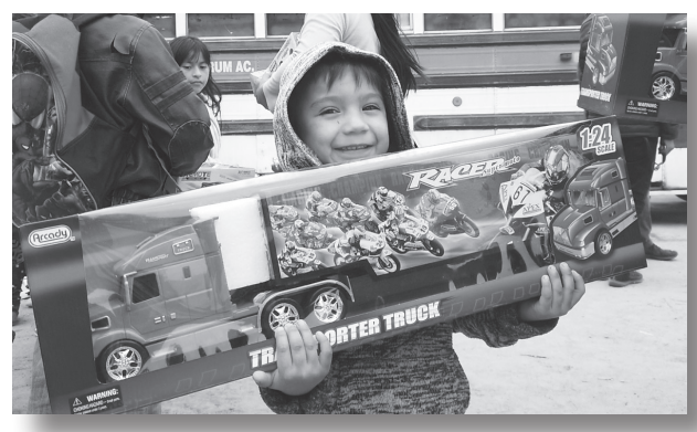
Christmas is a joyful time

Christmas is coming! Just thinking about it makes me remember a special delivery we made last December. We brought some food and Christmas gifts to a family who had recently lost their home and most of their possessions to a fire. We had rebuilt their home with the help of a US group, but we knew the family was still struggling. Seeing the kids & faces light up as they received their gifts filled our hearts. There is something special about a Christmas gift! Even in the toughest situations it seems to have the power to bring hope and smiles. We love Christmas and the opportunities it brings to share God's love with the poor.