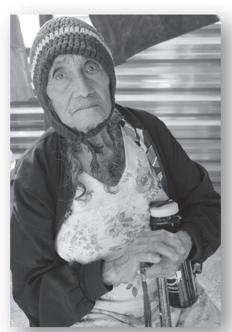
Tarps and blankets help protect the poor

derful. Warmth. Don't underestimate warmth. The cold gets bitter in the makeshift little shacks that so many in our neighborhoods call home. Just getting a family a little warmer in the winter is a great way to share God's love with them. May we be a blessing