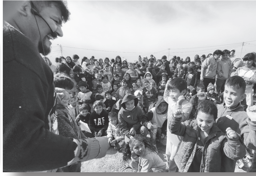
We serve a lot of kids!