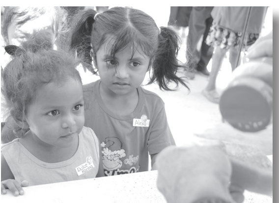
to the poor this year!

The winter brings cold and rain to the neighborhoods of Tijuana. Forecasts are pointing to heavy rains this year. Many homes are not prepared for the winter weather. Tarps and blankets become some of the most requested items in our communities. We plan to distribute as many as we can get our hands on. A tarp and a blanket might not seem like much, but a tarp can help keep the rain out, and the house dry. Add a blanket and you achieve something simple but won-