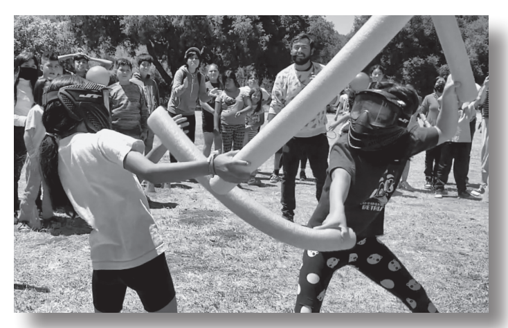
Kid's love our competitions