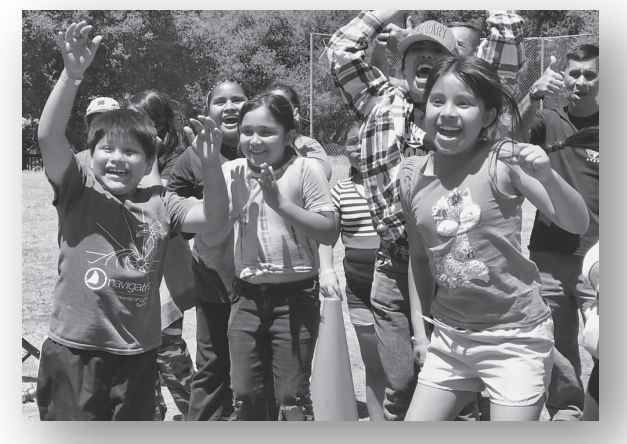
Having fun at camp

Camp is coming! If you were to peek in and see one of our meeting times with the 150 children 8-12 years of age who will attend camp in May you might see me with my worn-out Bible in one hand and my bear trap in the other. This is something that I love about camp. We have an opportunity to share God's word in engaging and creative ways with our kids from many rough Tijuana neighborhoods. And God's word is a powerful thing! The bear trap provides a strong visual representation of the dangers of sin, drug use, and other traps which pervade the tough streets at home. The Bible is the star of the show and the bear trap is a hook. The kids tune in. Getting them out of their neighborhoods and into