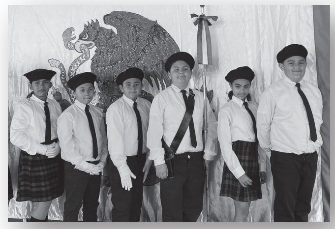
Education is important

I'm excited about our school supply distribution this month. Our goal is to provide 600 kids throughout our neighbor-