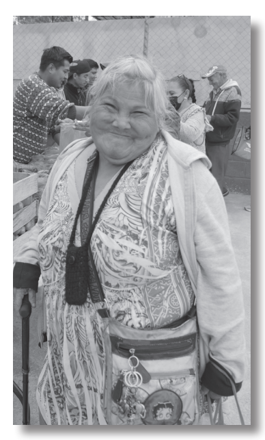
When we share with the needy we are often met with a smile