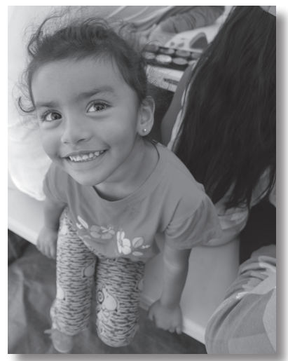
It's a joy to support young students!

hoods with school supply packets. The packets will include Crayola colored pencils, Elmer's glue, 5 composition notebooks, pencils, sharpeners, highlighters, rulers, erasers, and more! We want to bless the kids with high-quality supplies from the list the school gives them. We don't want them to struggle with broken pencil tips. For some, this packet of supplies will be a great help. For others, it may help the parents dare to send one more of their kids to school.