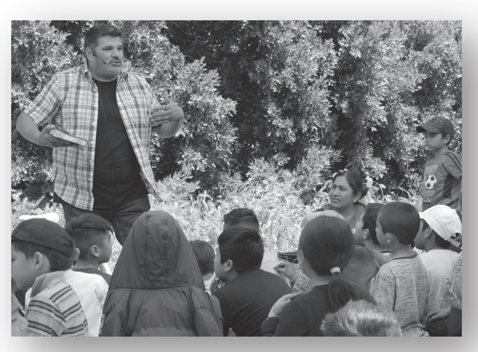
We teach the value of an education

Years ago I was dropping off some youth after a Bible study. The teens lived in an area of town where we had been told not to go because the gang members would break our windows. The local boys looked rather tough, but I made an effort to get to know them, and friendships were made as they enjoyed the sodas and chips I brought them. As I dropped off some youth around 10 that night I saw the girls getting ready for a night of hanging out and watching some friends race cars. The whole street was coming alive. These kids were poor, struggling, and had little knowledge of the disciplines that could help them later in life. I was eager to share Jesus, and to work with them. I looked over at a fellow minister and said, "I love serving here." He turned to me and replied, "Then