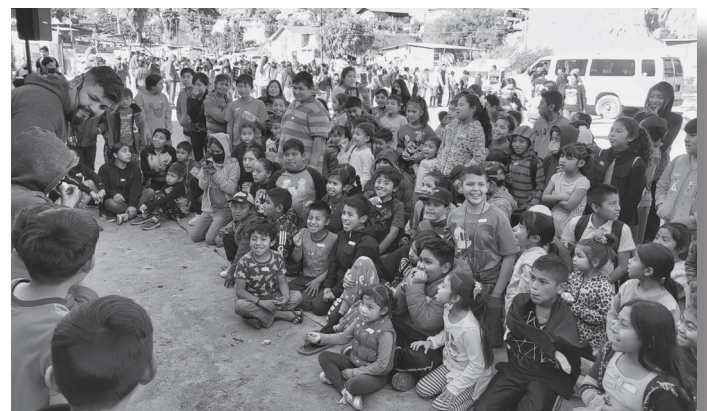
Fun with the kids in Granjas