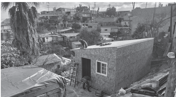
Building a home that will keep the rain out