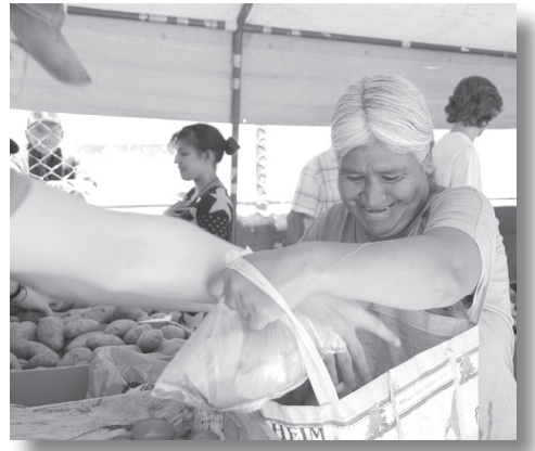
Food is a blessing

3 John 1:4" I could have no greater joy than to hear that my children are following the truth."