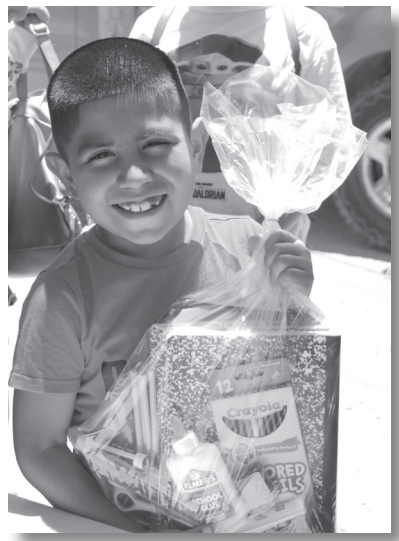
800 children received school supplies this month

We originally set out to give 600 school supply packets in our communities, but after seeing how many kids signed up from our neighborhoods we increased the number to 800 packets. That is a lot of kids! It has been a joy to support the education of the children who attend our outreaches. We saw a lot of happy students! Your support makes what we do possible, including adding 200 children to our school supply outreach. From all of our happy young students, thank you!