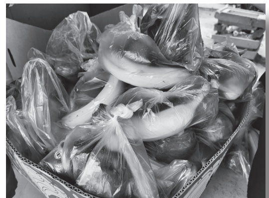
Bananas and Apples ready for delivery

Each outreach day we share a short message with the families who attend. The last few weeks I have been sharing John 3:16. God loves us and He sent Jesus to pay for our sin. He desires none to perish, but rather He came to bring us life! In John 10:10 (NLT) Jesus says, “My purpose is to give them a rich and satisfying life.” I told the group of mostly moms from the neighborhood that I could point out many good things that were available that day. We had popcorn, snow cones, fruit cups sprinkled with lime and chili powder, vegetables, fruit, and more. But the best thing I could point them to is that church across the street. We walk by it every day carrying our burdens! Yet Jesus invites us to come to Him and know the rich and satisfying life He gives!