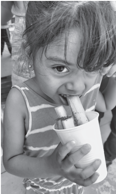
Cucumber, chile, and lime makes for a healthy snack

As I watched our staff prepare fruit that we would be handing out to children later in the day, I remembered a conversation I had with a child some time ago in Ejido Lazaro Cardenas, one of the poor neighborhoods we serve on the southern outskirts of Tijuana. We were walking in an empty field filled with small weeds and other wild plants struggling to survive in the arid conditions. I saw a small black leaf, which under closer inspection was revealed to be a green leaf covered with small black insects. I pointed out the insects to the child. He said to me, “Yeah, you can eat those. But only when you are really hungry.” He was likely repeating words told to him by his parents or some other caretaker in a time of distress. I imagined what it would be like to have no food to feed my kids, and after a time, with no other options, to resort to lying and telling them that it is okay to eat the insects they could find. “It’s okay when you are really hungry.” I imagine that is a painful lie to tell.