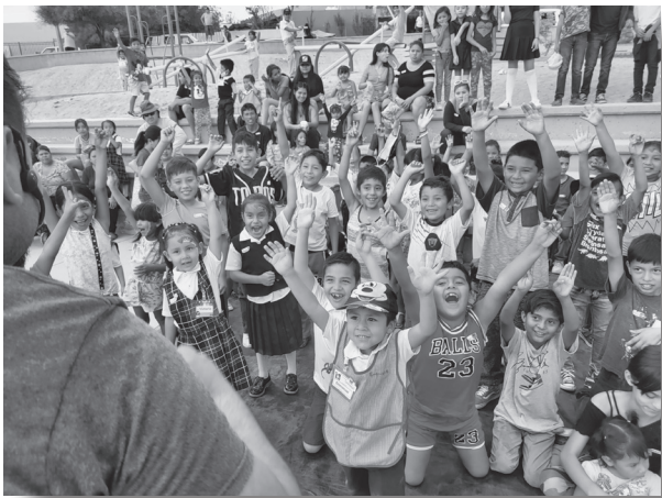
Gospel and games during our outreach day

Later that day a lady asked for more info on the church I had pointed out earlier. We talked to her and gave her the meeting times and contact information for the pastor. A few days later in another neighborhood a mom heard the message and struck up a conversation about her children and the difficulties in leading them down the right path. What she knew of religion was very work-oriented. I talked to her about the role God's spirit plays in our lives and His grace when we repent and come to Him. It is He who brings about fruit in our lives, not merely our own efforts! We come as we are and receive His grace. Offering assistance to the poor opens up a relationship with the communities we serve, and in turn, opens up opportunities to share the gospel. We see people respond to the messages we share. May God grant us success in connecting more families with the local churches. May