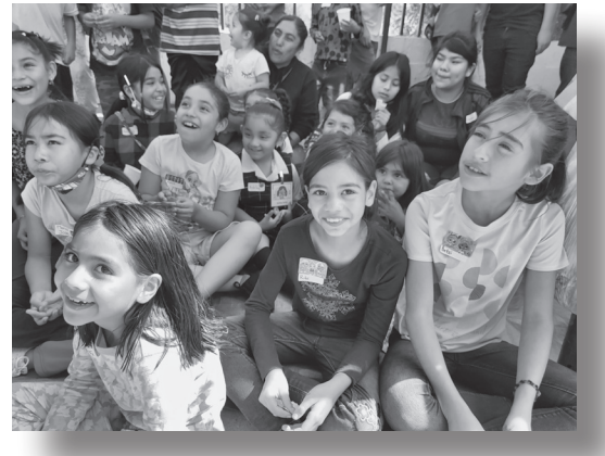
Having fun hearing the gospel

A few months ago we added a neighborhood close to the new Tijuana dump to our monthly rotation. The concentration of poverty in the community has led to large turnouts with more than twice the number of people attending our community outreach days there. We plan to bring gifts to this community for the first time this Christmas. This is a very exciting task, but one we cannot do without your help. We plan to bring gifts to a total of seven neighborhoods this year. There are many ways you can be a part of this! Financial gifts allow us to purchase toys in bulk. Physical gifts are also a great way for churches or communities to be involved with giving. You can even schedule a trip with us during the month of December and help us bring gifts and food to the communities in person. Your continued faithful support allows us to keep meeting