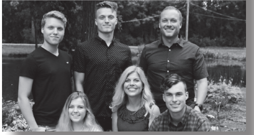
Our family on the day we moved from Michigan in 2013, and below a more recent shot.

Eight years ago when our family loaded up the Uhaul with all our earthly belongings and moved to Mexico, my four kids were still pretty young. Thirteen, eleven, nine and eight. As each of them grew, at different times, they made the move back to the States for their last year or so of high school to re-acclimate to life in the US and gain at least a small taste of a "normal" American high school experience. What struck me and what I am eternally grateful to God for is that each seemed to go back with a different perspective on life. They had been changed by their time in Mexico in ways that allowed them to appreciate their opportunity and realize that God is way bigger than the "first world" problems and challenges they faced.