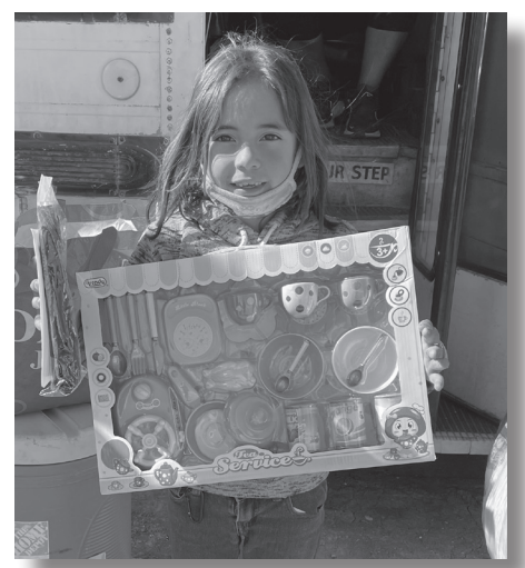
Through your prayers and gifts, Spectrum has continued to reach people in need. This young girl represents one of the almost fifteen hundred kids that received a Christmas present this year. Thank you!!

how God uses regular people just like you and me, to reach the world with His love and salvation. Because of your faithful prayers and giving, our dorm in Tijuana is ready to house groups and our team is in place. Having been enabled by the same gifts and prayers, our ministry continued throughout the pandemic. In fact, through God's leading and provision, it actually grew. We're grateful now that we have many new faces as well as the old that He has given us to work with!