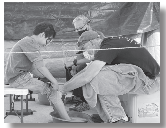
Spectrum has always been a place where believers come and serve those society has forgotten.