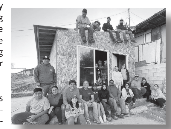
Recent group from LA down building a house for a family just before Christmas!

Obviously with the Pandemic, many groups have had to put their trips with us on hold. But I'm happy to say that as we begin 2022, the schedule is beginning to fill. And we're getting ready. Currently we are working on a curriculum which our staff will be sharing with teams all about