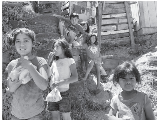
The kids in our neighborhoods love receiving our bags of fresh oranges and bananas, with of course a few pieces of candy thrown in!