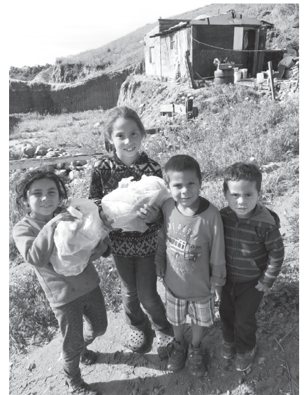
Thankful to be able to help families when they need it most!

" Look at the birds of the air; they do not sow or reap or store away in barns, and yet your heavenly Father feeds them. Are you not much more valuable than they?" - Matthew 6:26