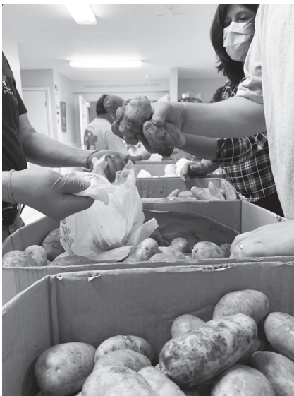
Packing bags of vegetables to go out!