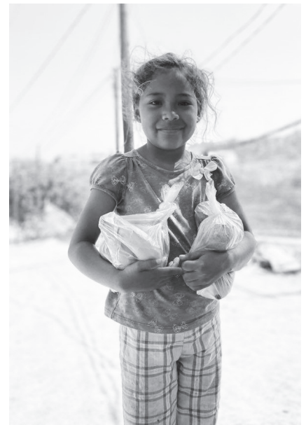
Bags of fruit provide a healthy snack for all the kids we work with!

"I have fought the good fight, I have finished the race, I have kept the faith." - 2 Timothy 4:7