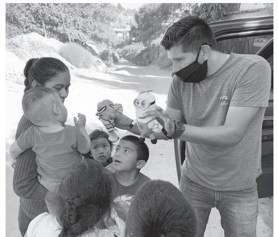
Because of you, Spectrum can bring joy and hope to the families we work with!