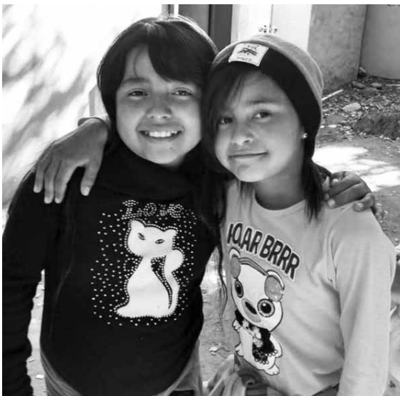
Camp is a place to deepen friendships!

know the way many of these kids eat in their homes throughout the year. Sometimes there's no food to put on the table. That makes the burritos and other delicious food the children receive, an integral component to their camp experience!