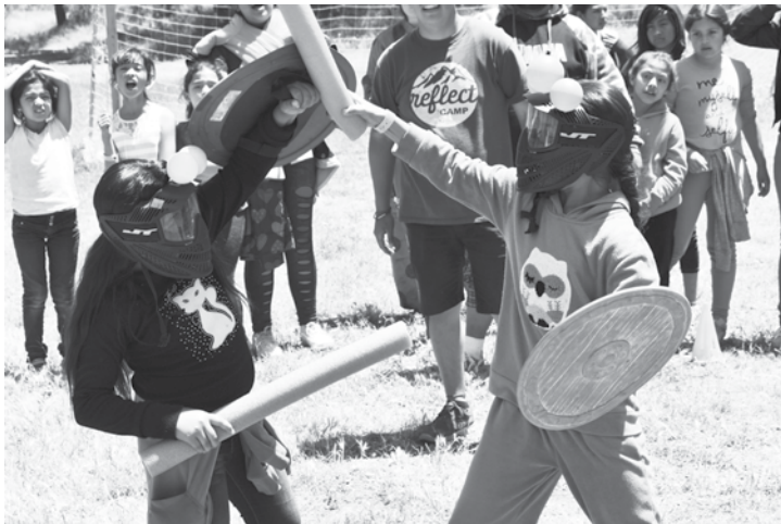
Kids love the games we have for them each year.

That God would be the star of the show. That He would be glorified! In the midst of all the fun, in the beautiful camp setting, and surrounded by adults who love them, we want each child to hear the message of God's great love for them and the salvation He offers through His Son, Jesus Christ.