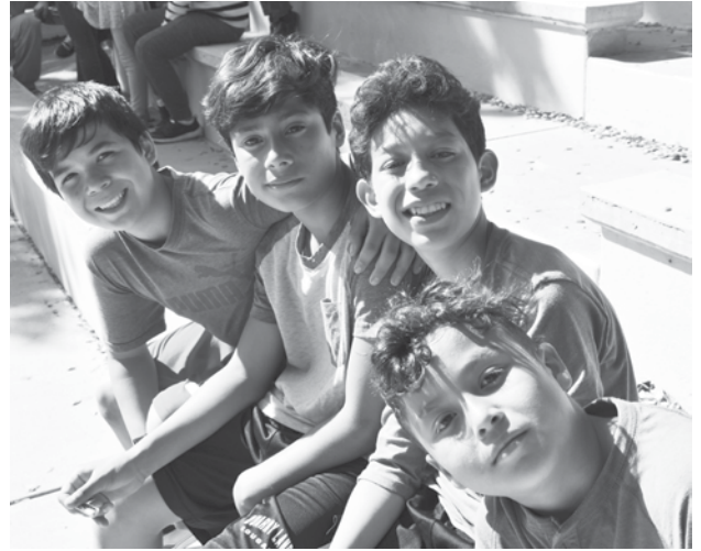
Kids are looking forward to camp!

God leads you, we sure could use your help preparing for that! We also would greatly appreciate your prayers. Asking God to work in lining up all the logistics. Petitioning Him for good weather and for safe travel in well working vehicles. Pray for our communications with parents, churches and orphanages so that we can get the word out clearly and effectively so every child can come! Pray for the interactions the kids will have with our staff and counselors, that we will reflect Christ. Ask that God would work through the skits, the fun videos and the teachings to to open the kids eyes to who He is. And may He use this time away from all the problems and struggles they have back home to reveal to them a loving God worth giving their lives to. In the end, that's our goal.