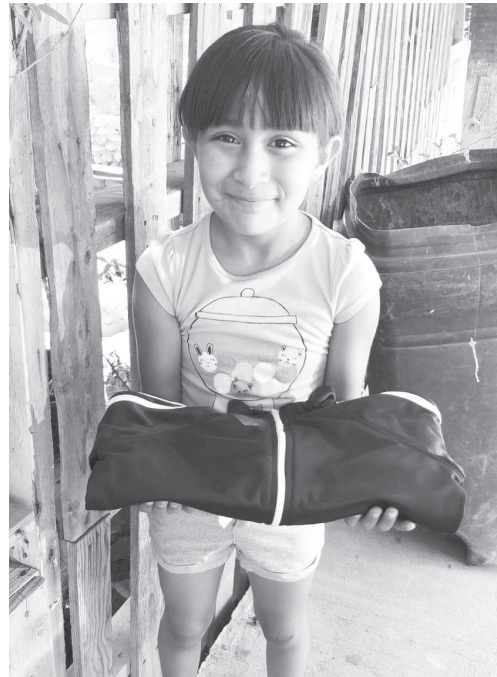
Kids not only need a formal uniform, but a gym uniform as well