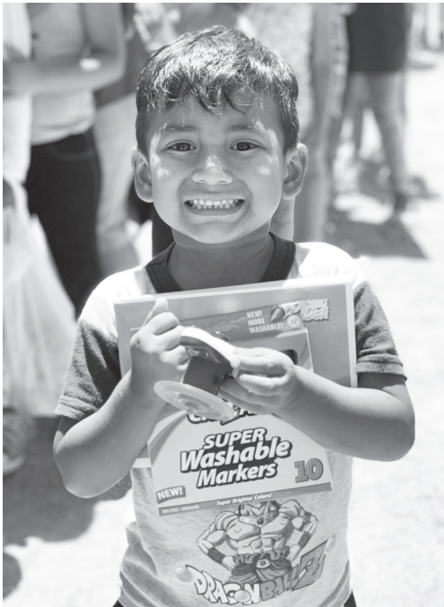
Thank you for helping kids get ready for school!

We are so grateful that God has used Spectrum to play a role in helping this church reach their community with the Gospel. It's because of your faithful prayers and giving that we are able to come alongside them and partner in specific ways. Truly, we couldn't do that without you!