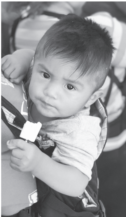
We plan to have a stuffed animal waiting for those who are too little to pick their own toy.

a toy that's special to them. They come off the bus with a smile, holding their toy and showing it to their moms and to their friends. Christmas is a special time for us here in our neighborhoods and in our ministry and kids look forward to it throughout the year. It really is a chance for us to speak love into the lives of the families we work with!