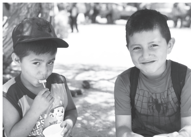
Naughty or nice? We don't keep track. Everyone gets a chance to get a toy!

PS - Thanks for everyone who took a few minutes to fill out our survey card from last month and send it in. We really want to communicate well with you, and the cards were a chance to see how we're doing! Thank you!