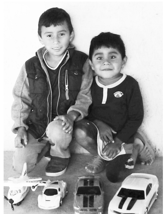
These two wanted to show me their toys they still have from the last two Christmases'. They sure do take good care of them!

Now follow me here, because what I'm about to say might sound weird! In reading this it reminded me of Christmas. I mean, what speaks to a child? Many things can. But so often a toy meets them at their point of understanding and can communicate a wonderful message of love and care. It means something to them. And when given with a smile can touch places in their heart that aren't easily reached. When one of the children connects with just the right gift it's really special. Each year we see how excited the kids are when we pull up with a bus full of toys. They walk the aisle, scanning the shelves. In there they will find