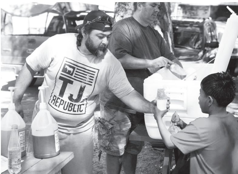
Ices are a big hit at camp when it's hot outside!

"...making the most of every opportunity, because the days are evil." Ephesians 5:16