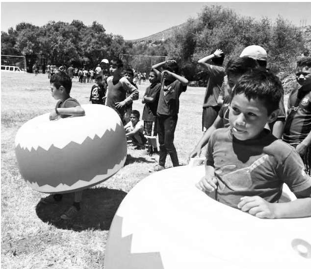
Eyeing up the competition

Camp is scheduled for May 3 rd -5 th and I'm happy to say that this year it's open to both boys and girls! The kids