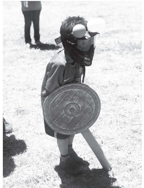
Geared up for games

We are so thankful for each of you who take the time to read our letters, stay caught up, give and pray for the special things God is doing here at Spectrum. It's with your help that He allows us to love and reach those we work with every day with hope and the good news of His salvation! We're grateful!