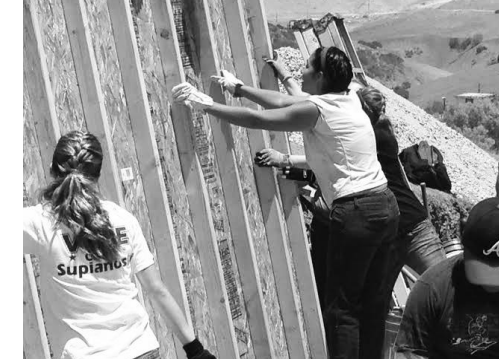
A group working together to raise a wall on a new home for a deserving family.