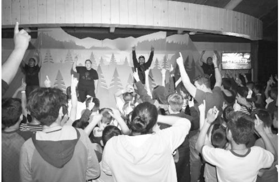
Hands raised during worship!