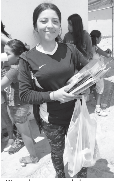
We are happy we can help so many kids with school supplies this year!